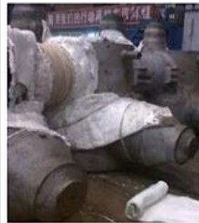
Flexible air-cooled inductor cable.