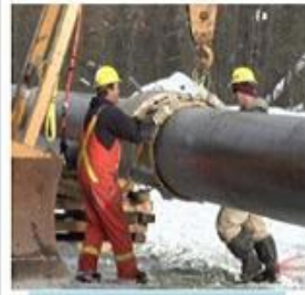
Oil gas pipeline preheat