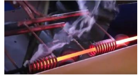
Induction Annealing And Normalizing