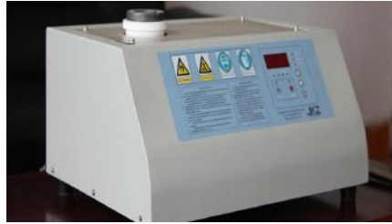
Precious Metal Melting